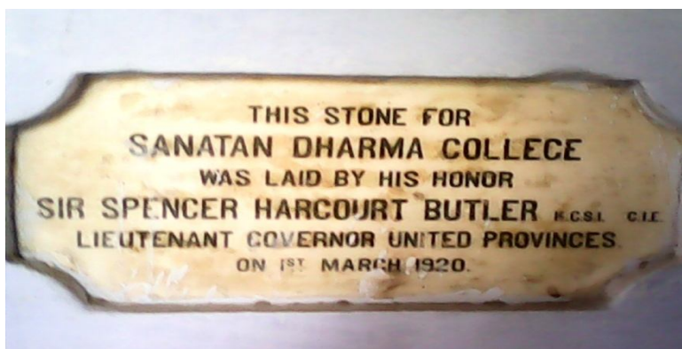
STONE LAID BY LIEUT. GOVERNOR OF U.P. FOR THE FOUNDATION OF V.S.S.D. COLLEGE KANPUR